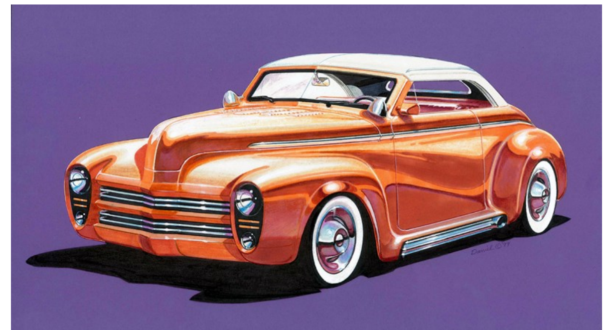
48 Dodge Coupe