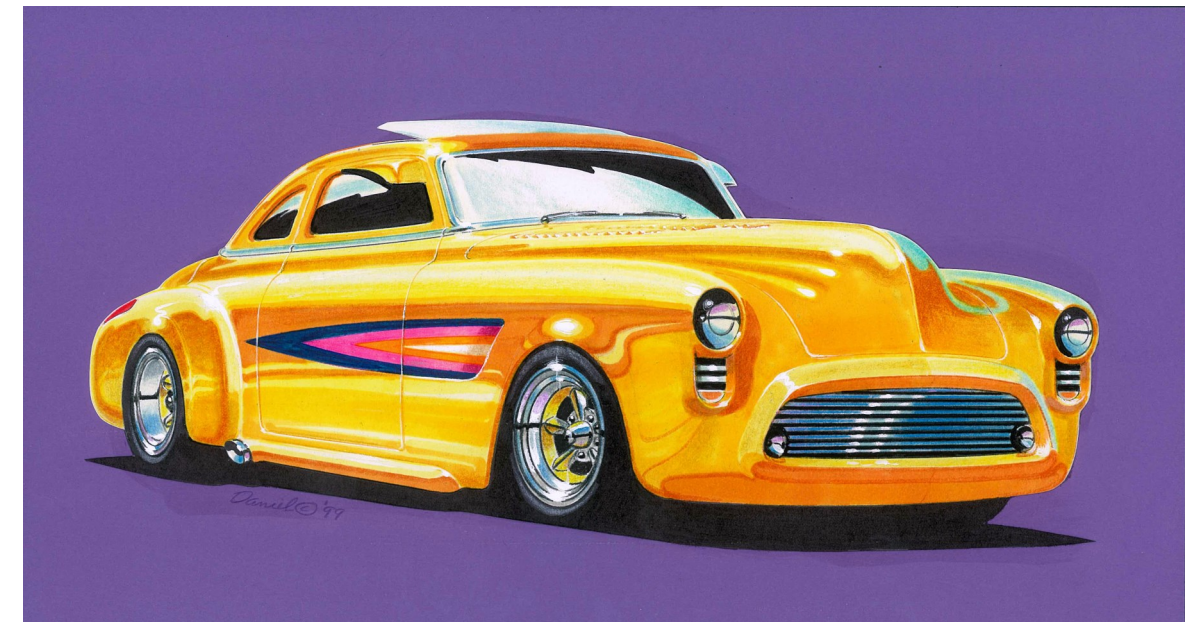
50 Oldsmobile Rocket