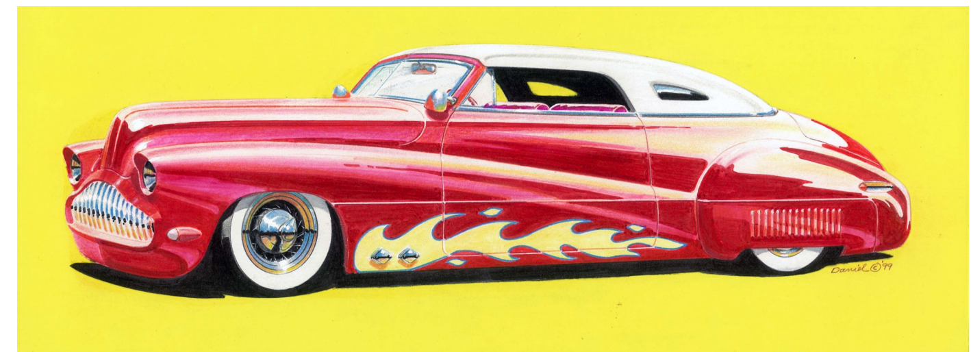
Buick Roadmaster 1942 Series