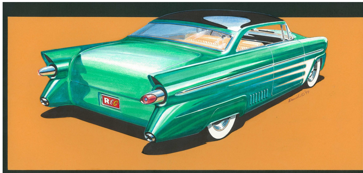
55 Ford Fairlane Coupe