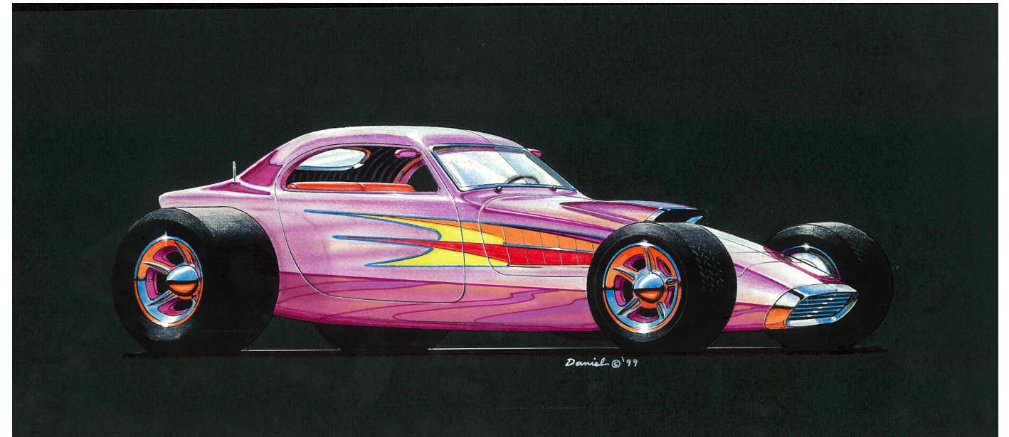
Thirty Something Coupe